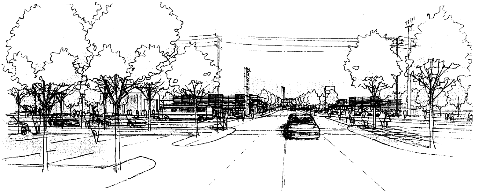
PERSPECTIVE SKETCH MAIN ENTRANCE FROM INTERSECTION @ NE 32ND AVE